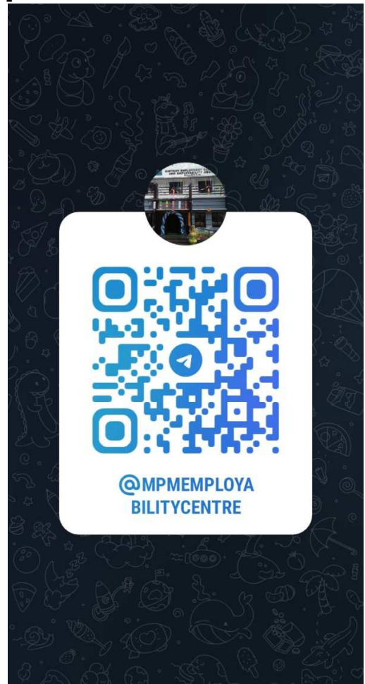
EMPLOYABILITY CENTRE TELEGRAM CHANNEL